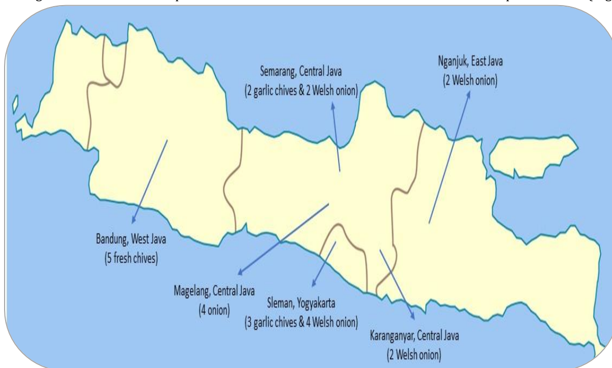
Figure 1. Sampling locations within Java Island, Indonesia, and numbers of the collected four Allium spp samples.

from Magelang Regency, Central Java Province. Two Welsh onion samples were collected from Karanganyar Regency, Central Java Province; two from Semarang Regency, Central Java Province; four from Sleman Regency, Yogyakarta Special Region; and two from Nganjuk Regency, East Java Province. The total number of obtained samples were 24 (Figure 1).