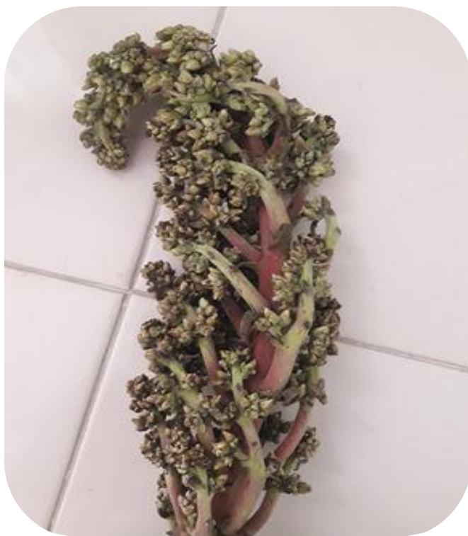
Figure 1. Floral Malformation

Isolation, identification and biological mediated management of Fusarium mangiferae : The fungus was isolated on potato dextrose agar media and multiplied on the very same to perform other experiments. The fungus was identified as Fusarium mangiferae under the microscope and some illustrated editions of the fungal identification manuals.