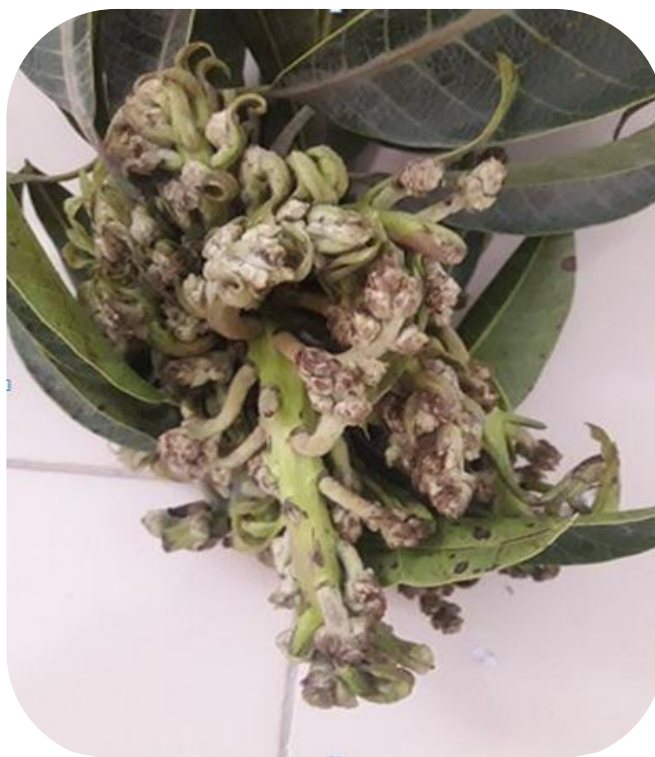
Figure 2. Vegetative Mango malformation

Isolation, identification and biological mediated management of Fusarium mangiferae : The fungus was isolated on potato dextrose agar media and multiplied on the very same to perform other experiments. The fungus was identified as Fusarium mangiferae under the microscope and some illustrated editions of the fungal identification manuals.