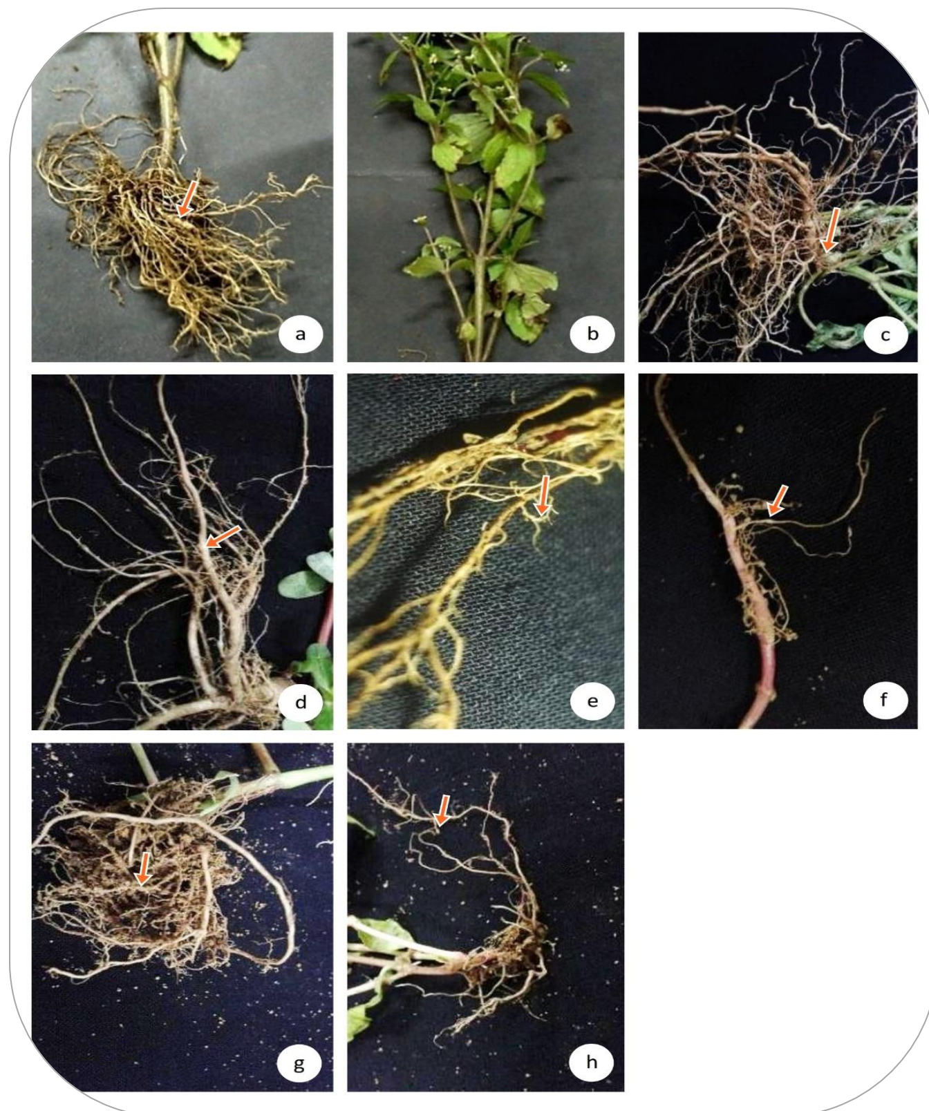
Figure 1. Symptoms found on weeds; (a) root-knot on A. conyzoides , (b) yellow and wilt leaves, (c) root-knot on A. houstonianum , (d) root-knot on P. oleracea , (e) root-knot on E. indica , (f) root-knot on A. spinosus , (g) root-knot on B. alata , and (h) root-knot on B. laevis .