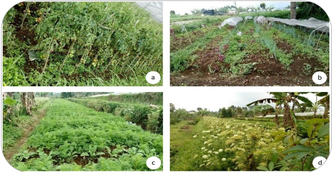
Figure 3. Land condition and weed distribution on the observational land; (a) tomato, (b) celery, (c) carrot, and (d) carrot seedlings