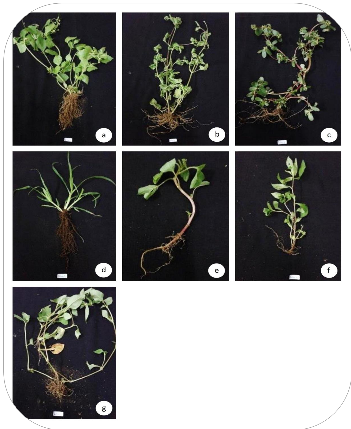
Figure 2. Weed species associated with plant nematode parasites on this study; (a) A. conyzoides , (b) A. houstonianum , (c) P. oleracea , (d) E. indica , (e) A. spinosus , (f) B. alata , and (g) B. laevis .